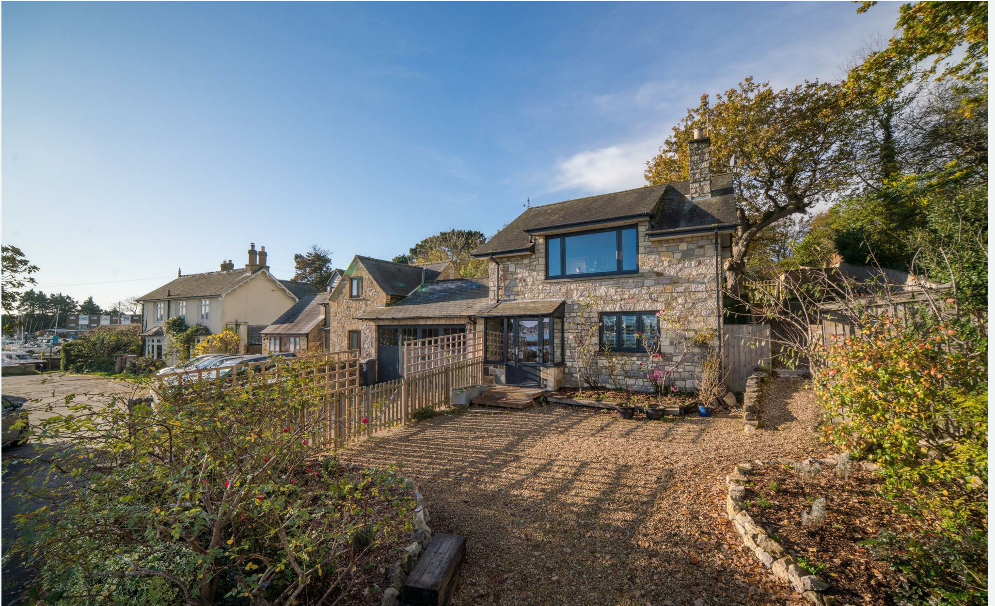
Oak Trees, Mill Road, St Helens, Isle of Wight, PO33 1YH